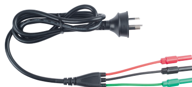
TEL_EL (Optional) (For 1812 EL, 1813 EL)