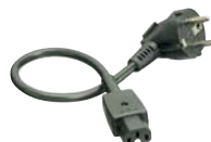
EXTL100-02 (Schuko plug)