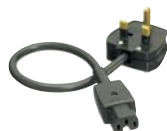
EXTL100-02 (UK plug)